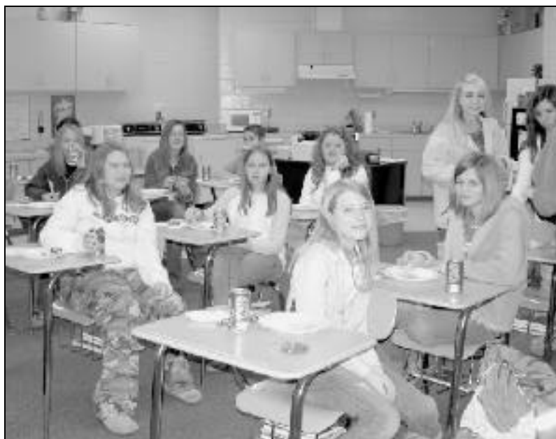
The Geneva Middle School students who received all A's and A's and B's on their report cards enjoyed refreshments recently provided by the SGA.