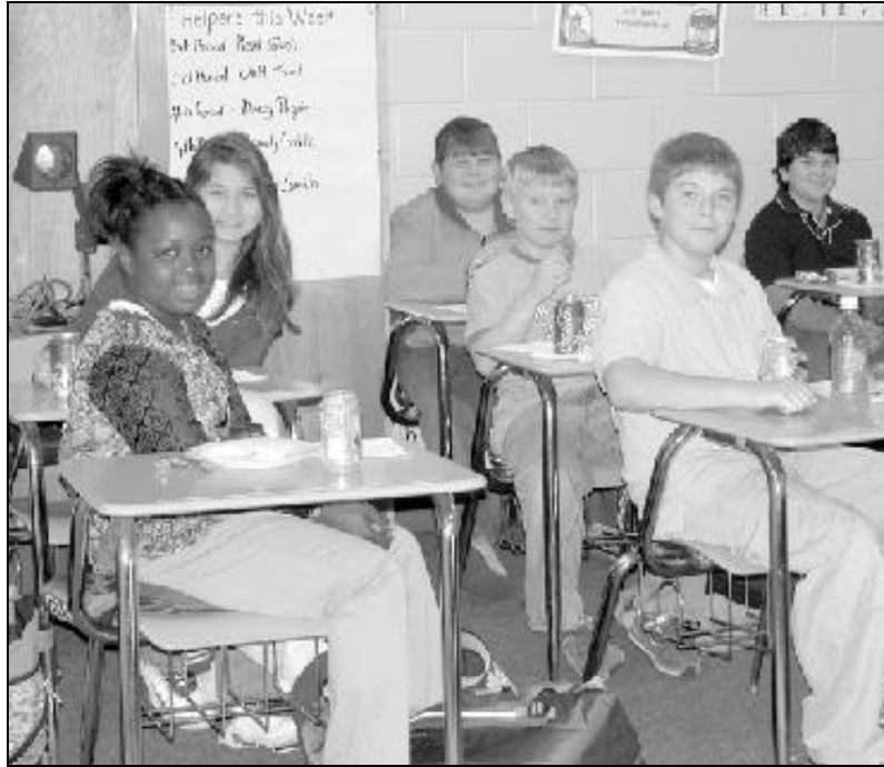
The Geneva Middle School students who received all A's and A's and B's on their report cards enjoyed refreshments recently provided by the SGA.