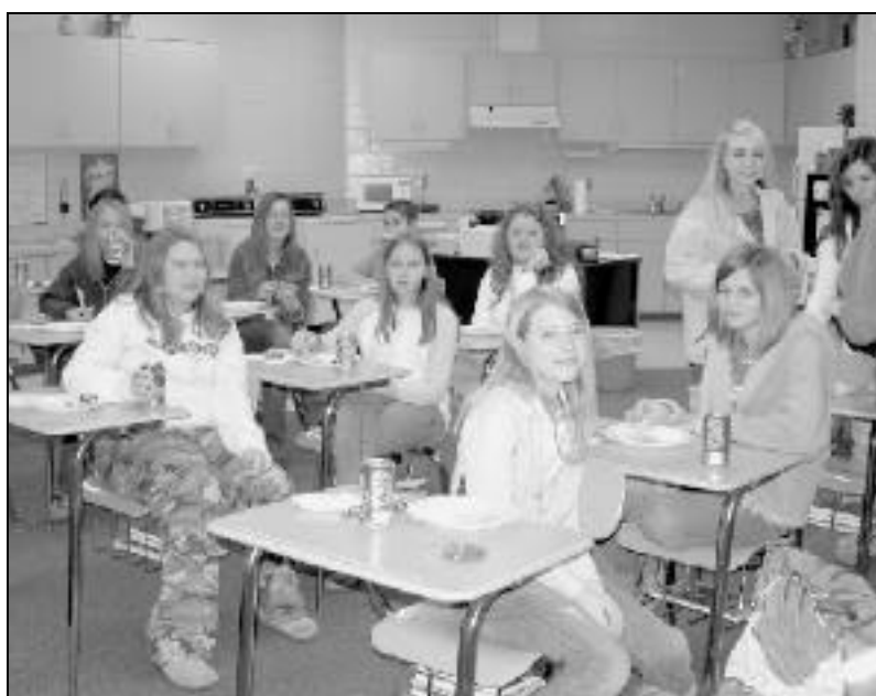
The Geneva Middle School students who received all A's and A's and B's on their report cards enjoyed refreshments recently provided by the SGA.