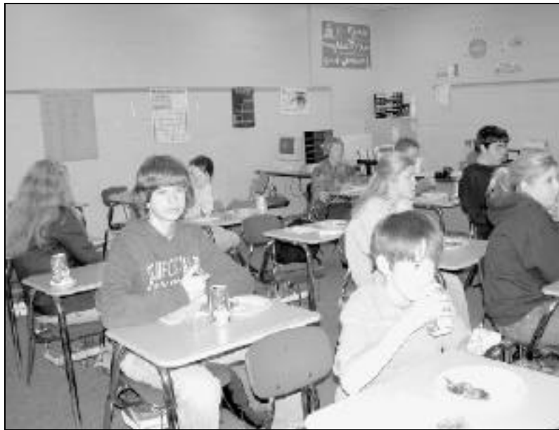
The Geneva Middle School students who received all A's and A's and B's on their report cards enjoyed refreshments recently provided by the SGA.